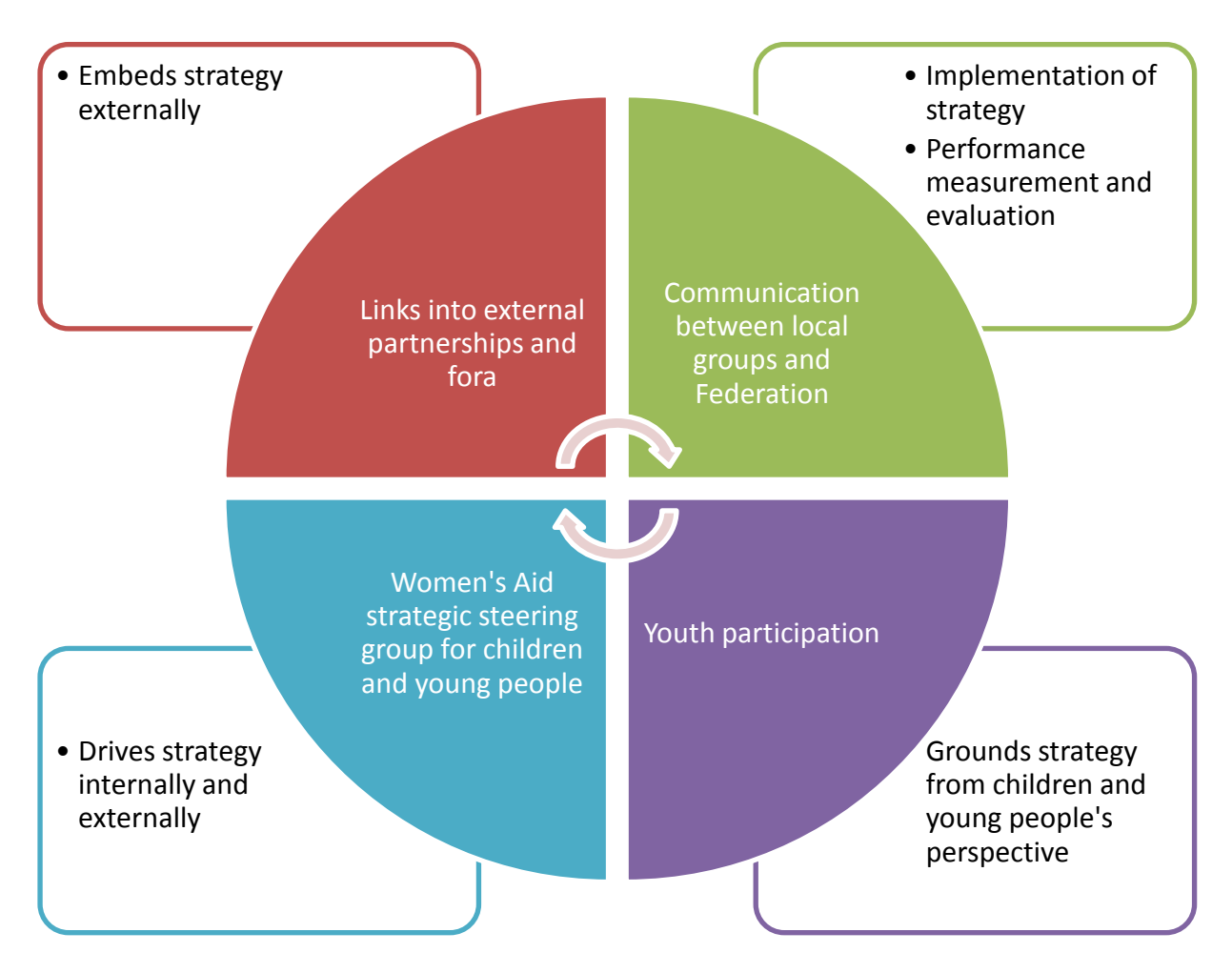
Figure 8, model for driving strategy

The diagram below presents a working model for driving the strategy forward over a five year period.