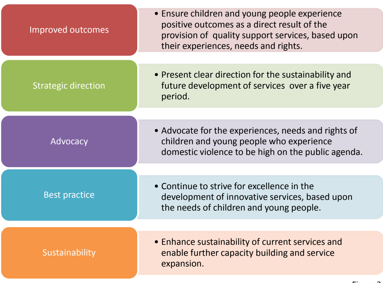
Figure 3 Internal strategic drivers

The internal drivers for the development of "Our Place-Safe Space" are as follows: