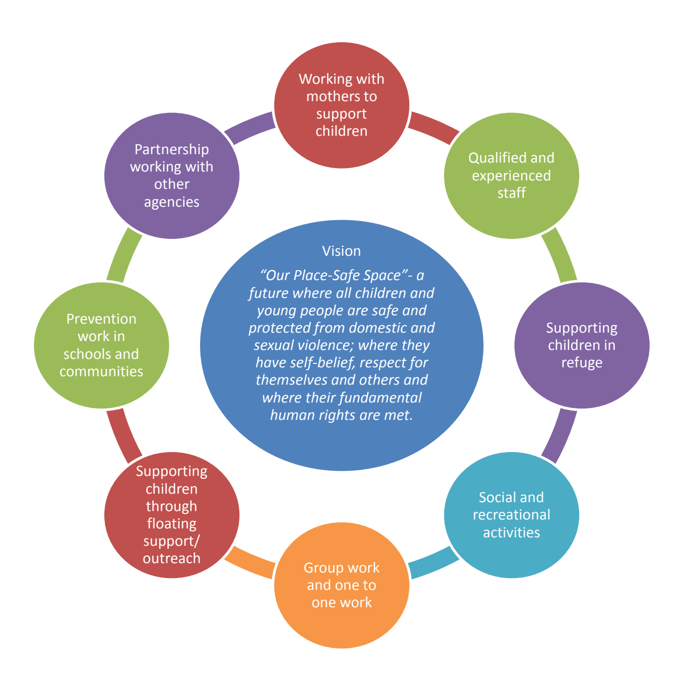
Figure 2 Women's Aid model for working with children and young people