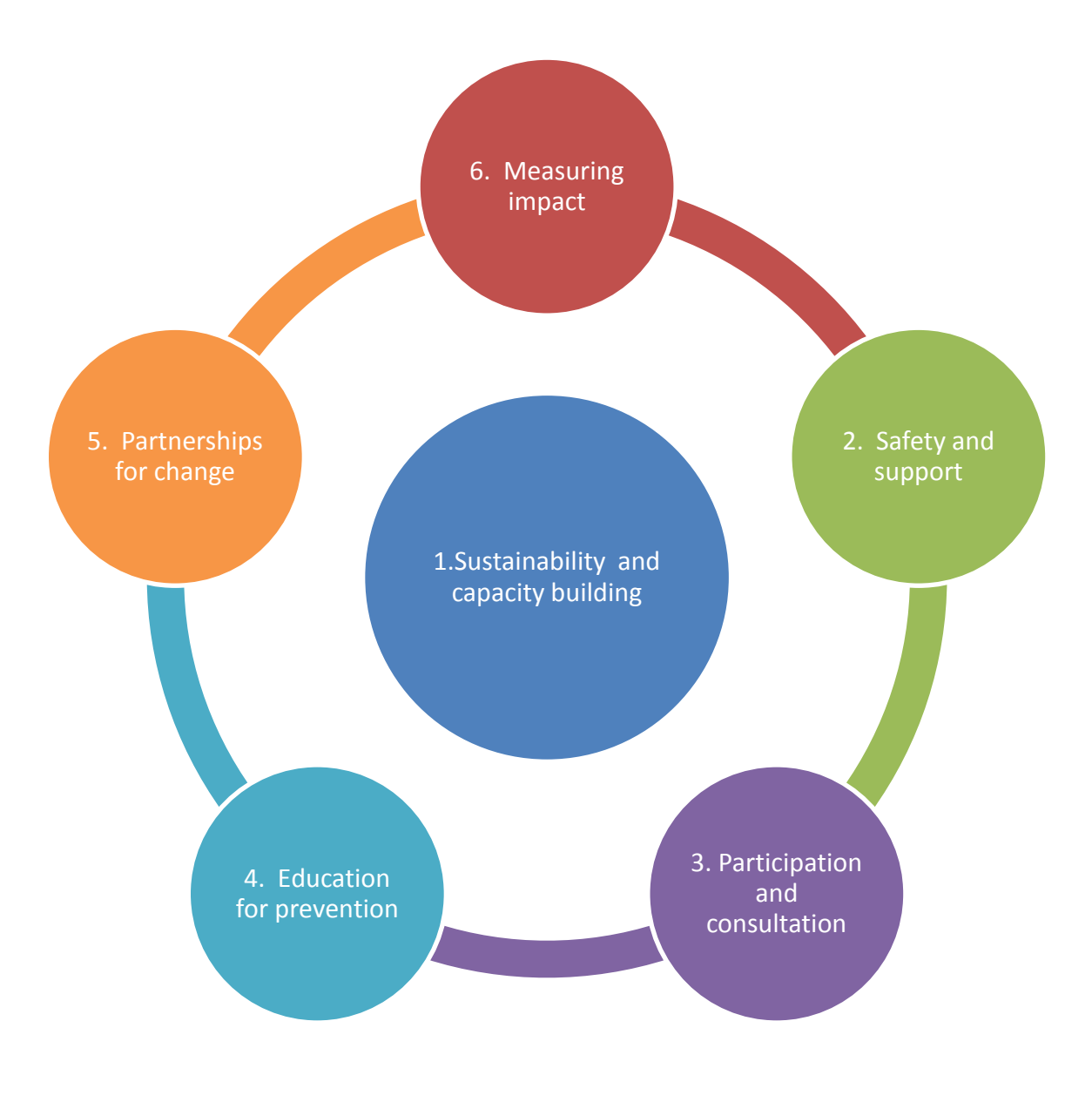
Figure 7 Strategic themes

This strategy has six key strategic themes. These are all inter-linked and inter-dependent. The strategy is based upon a holistic approach to all six themes and will only work if attention is paid to each. The first strategic theme (centre) focuses upon sustainability and capacity building and is core to the realisation of all other strategic themes. Without the presence of core funding and a regional support and capacity building framework, the aims and objectives listed under each strategic theme will not be delivered.